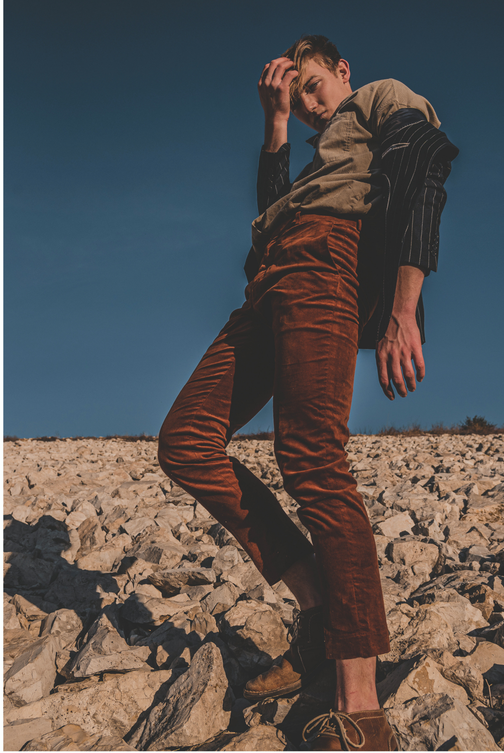
LEFT PAGE SHIRT: H&M, BLAZER: ALAIN DUPETIT, PANTS: H&M